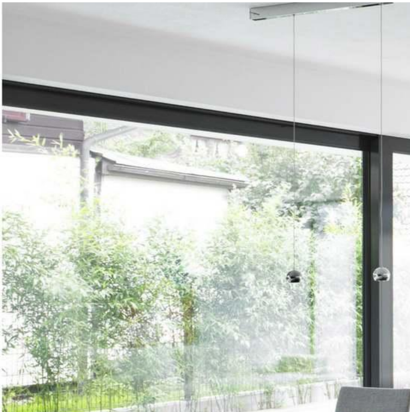
SGG PLANITHERM® FAMILY