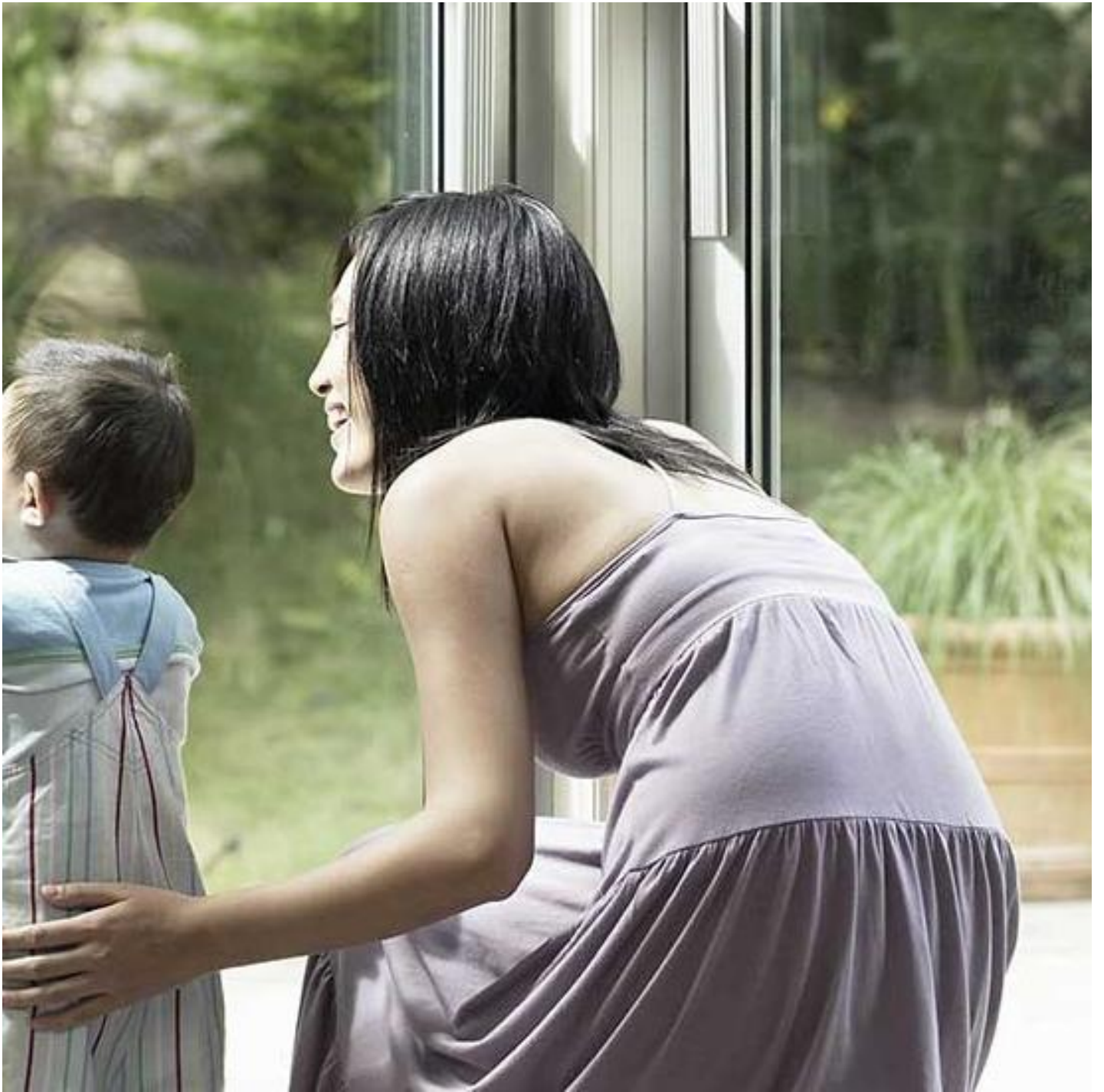
SGG STADIP PROTECT