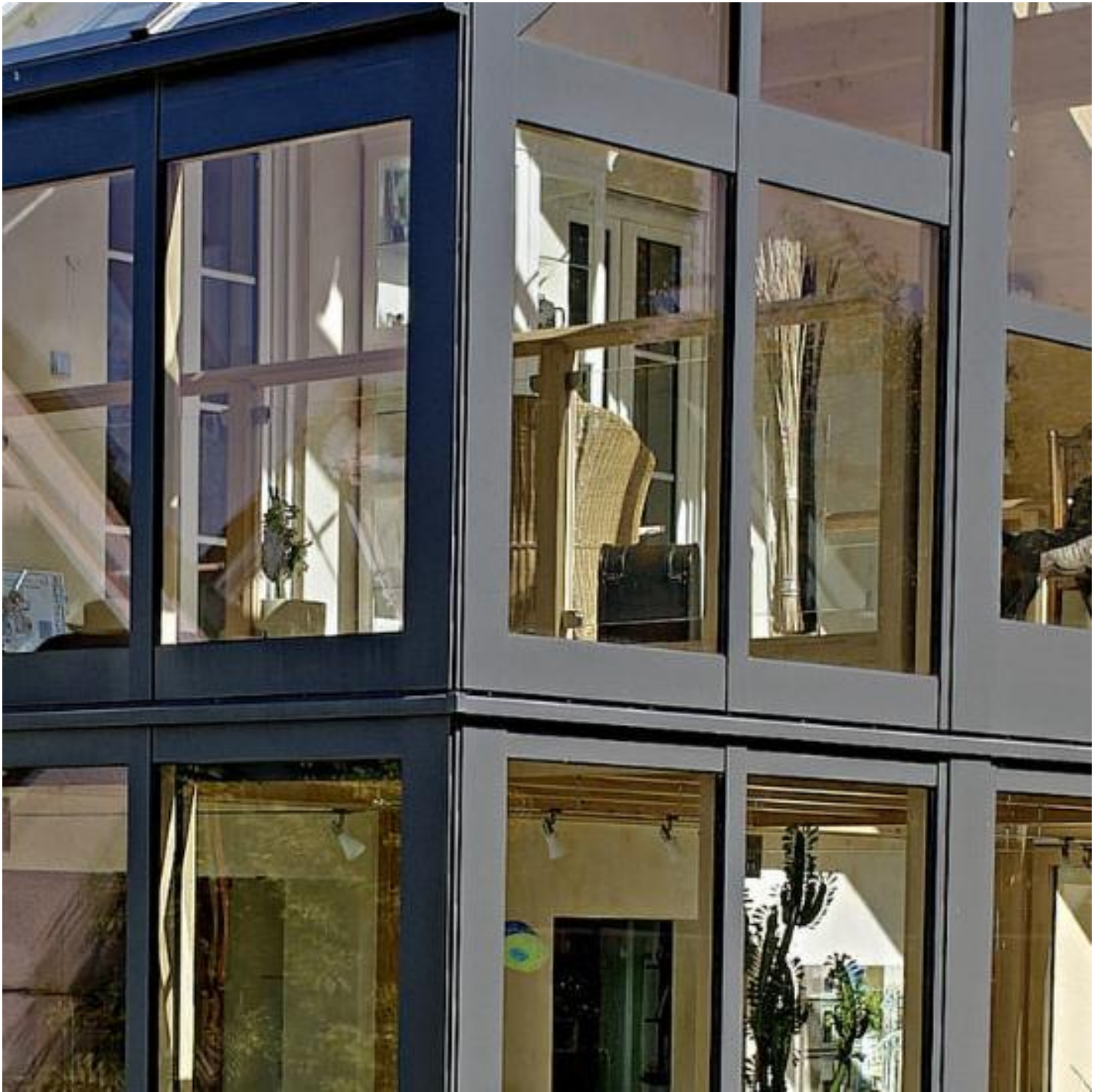
SGG BIOCLEAN® Azura+