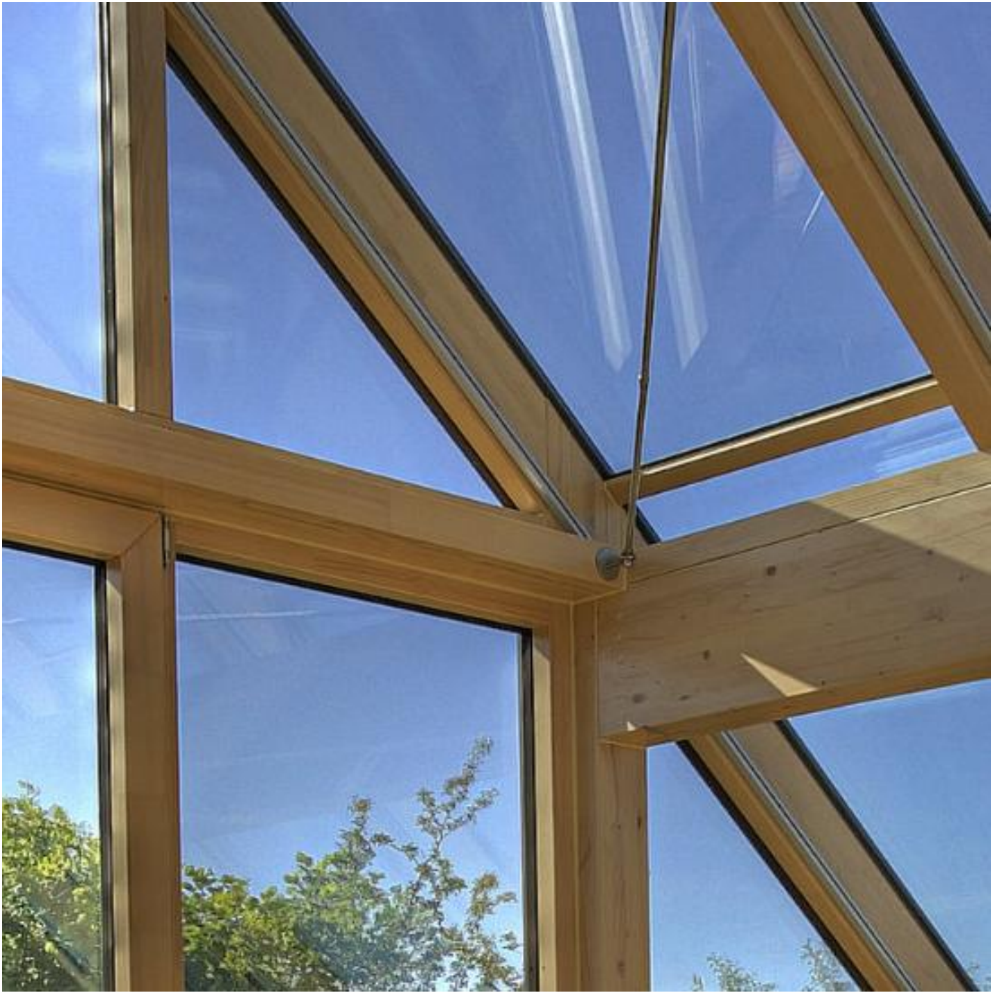
SGG BIOCLEAN® Azura