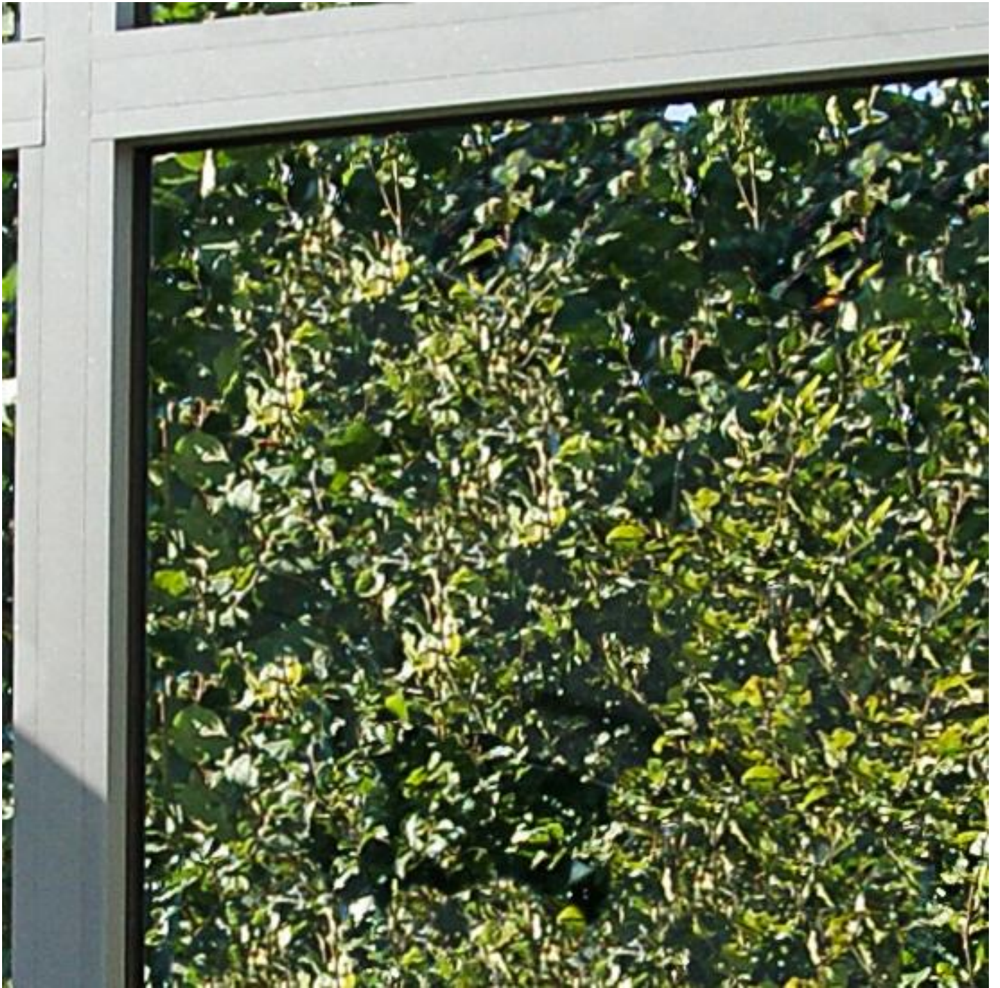
SGG BIOCLEAN® Natura