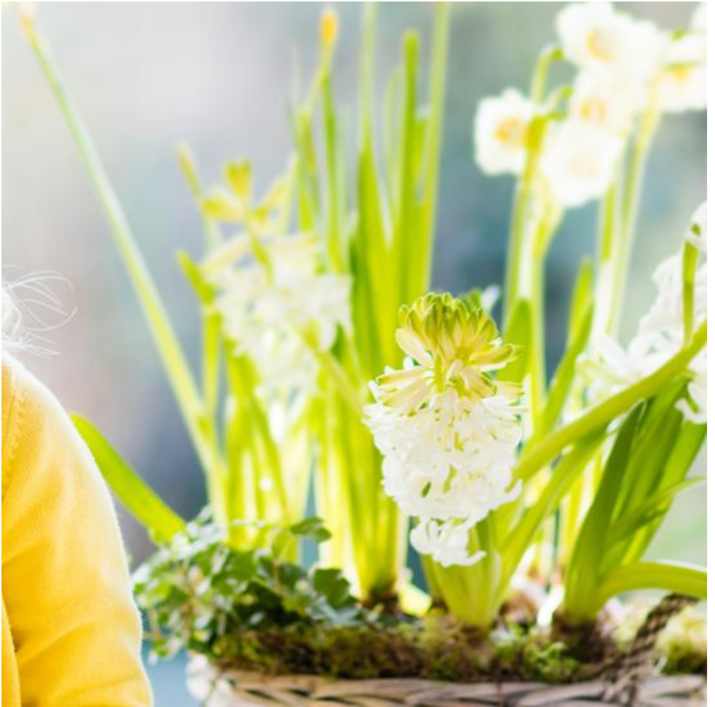
PLANITHERM® ONE T